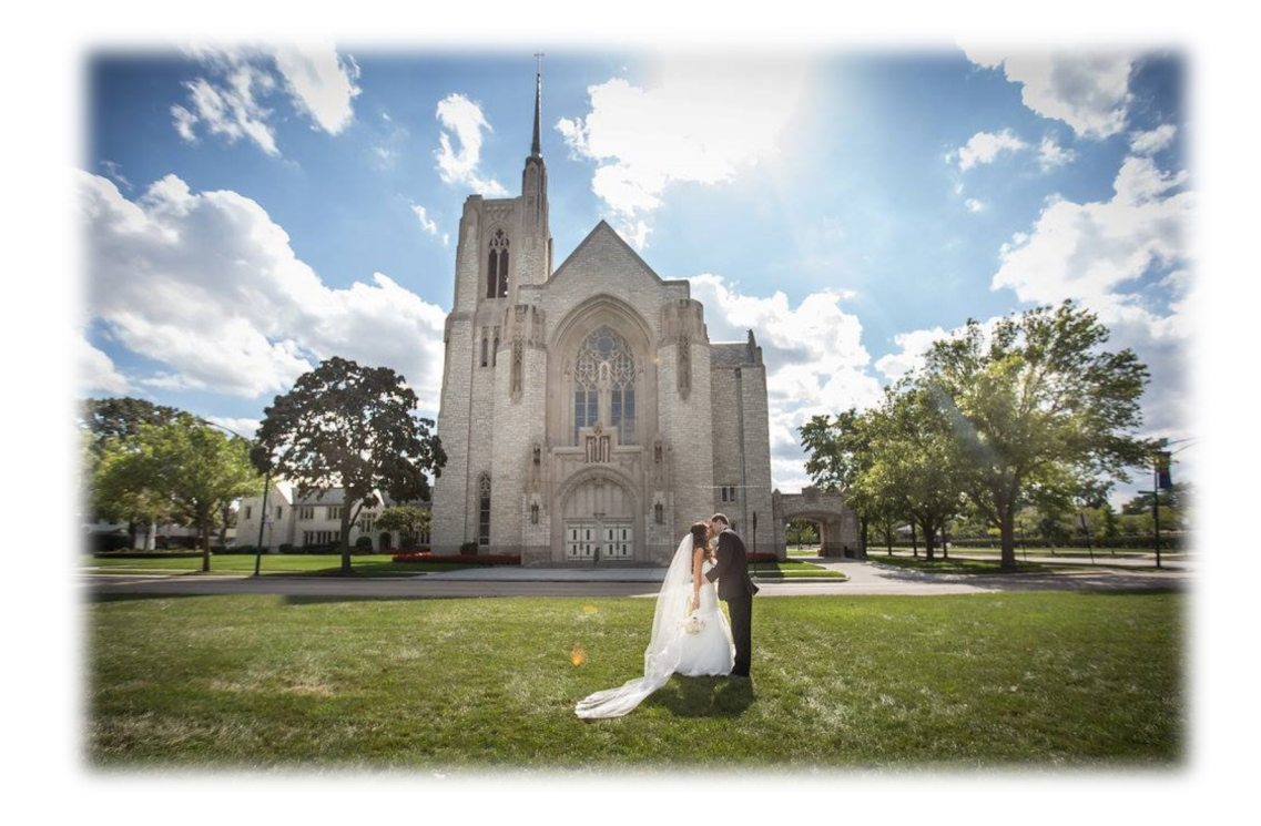
Queen of All Saints Basilica

6280 N. Sauganash Avenue Chicago, IL 60646 773-736-6060 www.qasparish.org